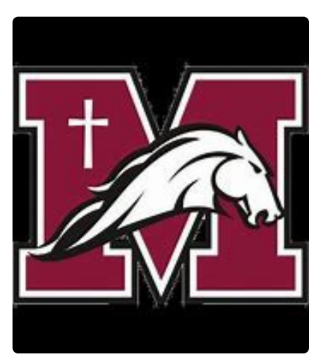
link to website https://www.saintmichaelmust angs.com/